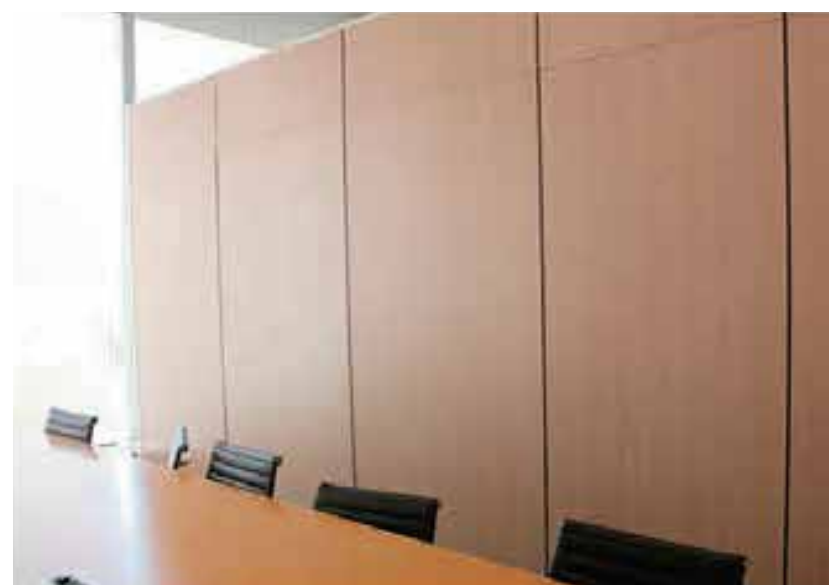
Solid Wall 非玻璃隔牆 A plate cove, steel spray, plastic plates and other panel materials available, each piece is the effect of noise.