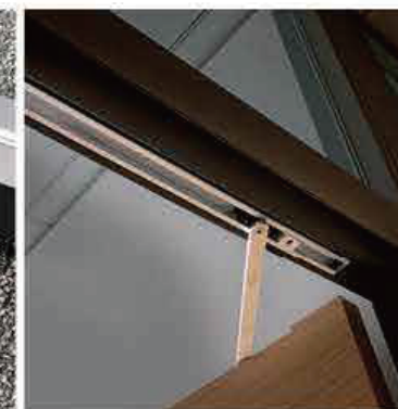
Door Closer 閉門器