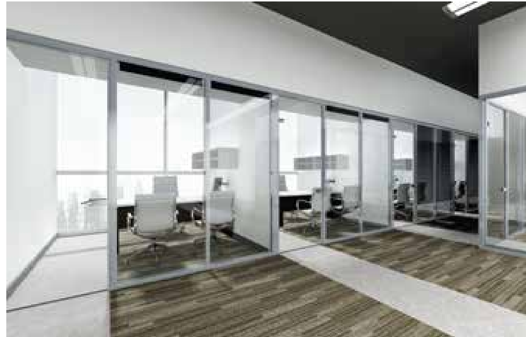
Glass Door 玻璃掩門