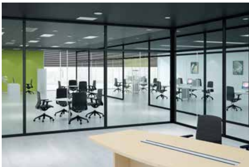
Glass Wall 玻璃隔牆 Class partition can be divided into the single glass and double glass screen, double glass can be configured to shutter device.

根據材料的不同分為玻璃門和塑色門. 可額外分段, 上段屏風因應客人對材料及尺寸需要而設. 可配置單掩門, 雙掩門. 單移門. 雙移門.