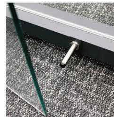
Door Stopper 門頂

Brilliant Walls 高隔牆系列產品, 卓越的品質, 對外觀和結構進行全面的優化, 外觀更顯優雅大氣, 線條簡潔流暢, 功能更加全面. 與傳統的隔牆方式相比, 具有流動性, 簡易裝拆, 多功能性及環保美觀等諸多優點.