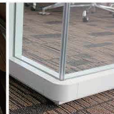
Frameless Corner Connection 無框 90 度連接