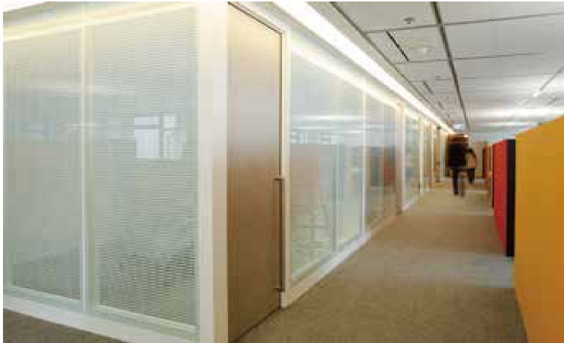
Wood Door 木掩門